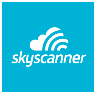
Skyscanner (Search for cheap air tickets)