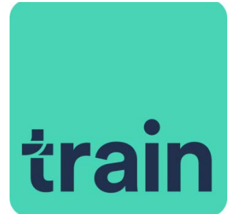
Trainline (Search for train schedule in UK)