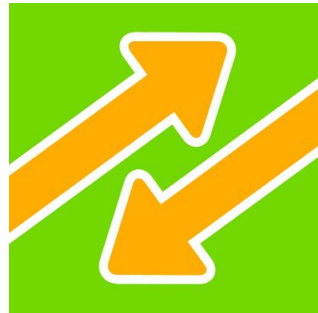
Flixbus (Buy Bus tickets in EU Countries)